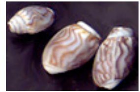
Olivella pycna Berry, 1935

All of the mentioned contributors had collected extensively locally and were all very familiar with most of the species to be found in the northwest. I believe that there are very few beaches from Vancouver Island to Oregon that have not been investigated at least once by one or more of them. All of them had collected O. biplicata and O. baetica in numerous locations along the coast, but not one of them nor any one else is mentioned in the checklist as having collected O. pedroana . Olivella pycna replaces Olivella pedroana in literature for the Pacific Northwest.