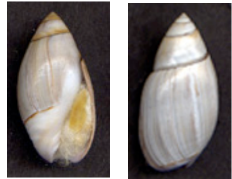
Open Coast beach, Mukkaw Bay, Neah Bay, Clallam Co., Washington. Specimens are 32 and 35 mm. G. P. Holm collector.