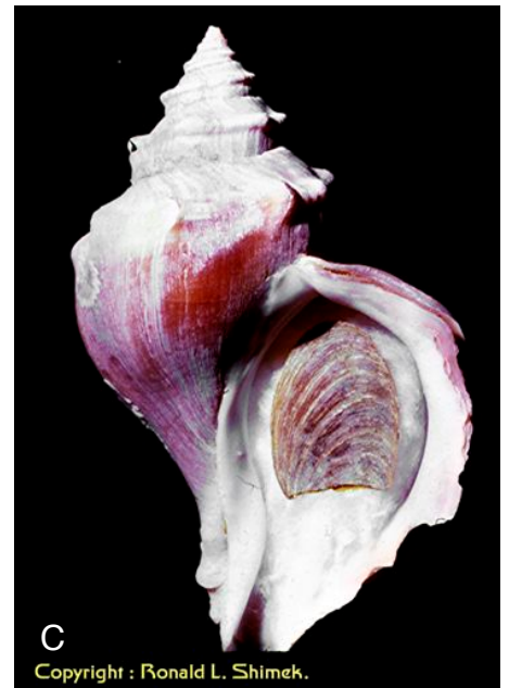
Figure A. Neptunea pribiloffensis . Specimen is about 10 cm (4 inches) long. Collected from the eastern Bering Sea. Figure B. Neptunea lyrata . Specimen is about 12 cm (5 inches) long. Collected from the Strait of Juan de Fuca, south of San Juan Island, Washington. Figure C. Neptunea heros (Gray, 1850) is one of the more “flashy” northern Neptunea species. This specimen was about 19 cm (7 inches) long and, when living, the shell color was an intense magenta. Figure D. Neptunea pribiloffensis female depositing her egg-capsule mass. The snail is about 75 mm (3 inches) long. Note the flaccid, baby-sitting anemone in the lower left corner. Taken intertidally near Homer, Alaska.

Neptuneids are by no means rare in the Pacific Northwest; they have been collected well into Puget Sound, and may be quite abundant in areas to the north, particularly in the cooler waters of Alaska and northern British Columbia. In our area they tend to be restricted to the subtidal habitats, a fact that makes them seem uncommon, but I have collected several species by dredging and diving in the San Juan Islands, and some, such as Neptunea lyrata (Gmelin, 1791) or Neptunea tabulata (Baird, 1863), are fairly easy to find.