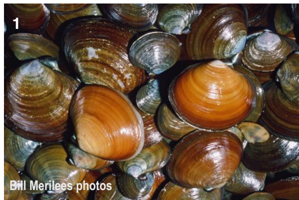
Variation in colour morphs of Varnish Clams in Departure Bay, Nanaimo, B.C. Note: patterned juvenile (lower right center)

This article is based on a series of 9 samples (100+ clams in each) of Nuttallia taken at Departure Bay in Nanaimo, B.C., between March, 2010 and May, 2011, and a single transect made at Manson's Landing, Cortes Island, B.C., in 2000. At this latter location, an evenly sloping beach with a similar sandy gravel substrate, offered an ideal situation to determine this species' intertidal distribution.