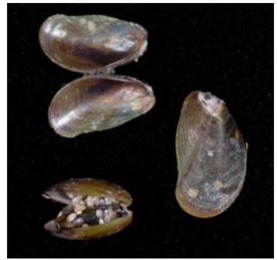
Fig. 2. 'Musculus' taylori , to 5 mm length, collected by W. (Bill) Merilees, Francis Point, Ucluelet Peninsula, B.C. May, 2011. Note specimen on lower left with an internal brood.

They are still a mystery and a recent compilation and review of the NE Pacific bivalves, by Coan et al. (2000) suggests that a new genus is required. Their smaller size, shell sculpture and the larval development, brooding internally rather than utilizing the byssal nest, appears to warrant separation, and for them to be known as "dwarf-mussels".