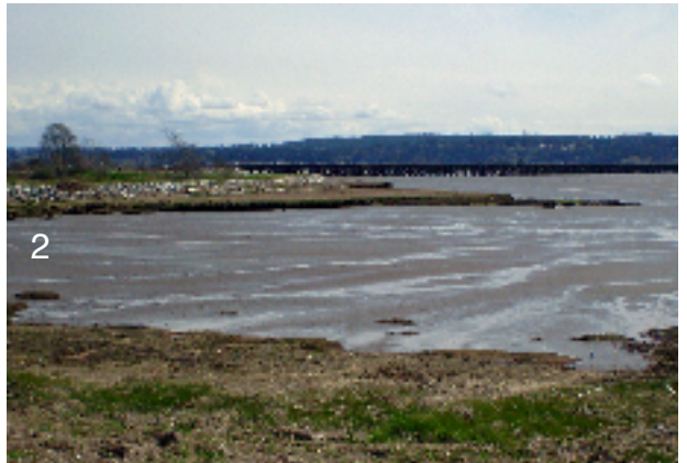
Above - Mud Bay Park. 2 on map.

Left - Vespericola columbiana columbiana (Lea, 1838)