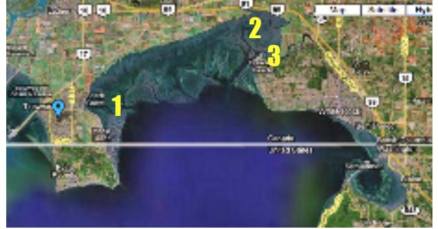
Google Image map of Boundary Bay.

The first area I looked at was Beach Grove in Tsawwassen. There is a parking area at 12th Ave. and a trail leads from it into a park that extends along the shoreline to Maple or Centennial Beach near the Point Roberts border. The area that I wanted to check on that day was a salt marsh at the beginning of the park. I was looking for the introduced snail Myosotella myosotis (Draparnaud, 1801) and also the smaller native snail Assiminea californica (Tryon, 1865).