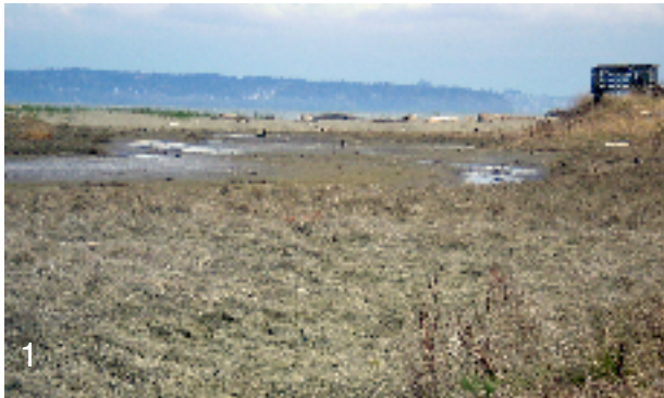
Above - Beach Grove salt marsh. 1 on map.

1. Beach Grove. 2. Mud Bay Park. 3. Blackies Spit.