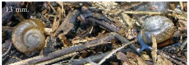
Top left - Myosotella myosotis (Draparnaud, 1801)