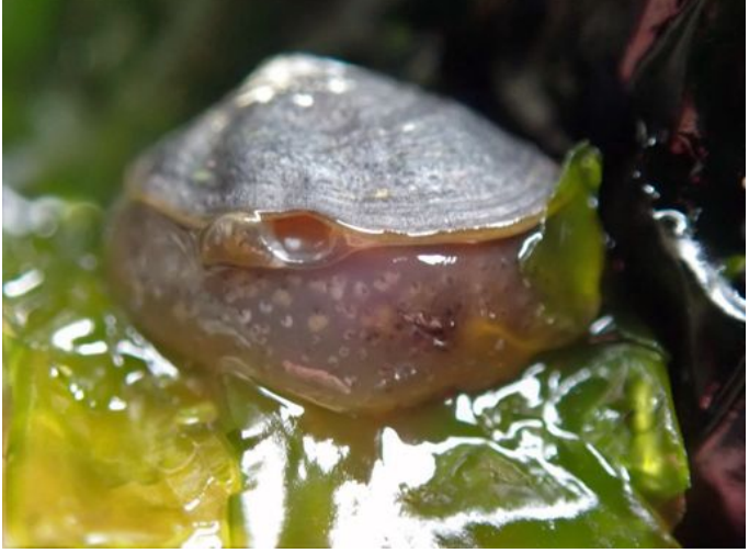
Fig. 1 Siphonaria thersites on intertidal rockweed, Fucus. Neah Bay, WA.