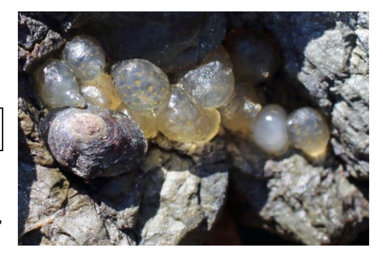
Fig. 3 Egg masses of Siphonaria thersites June 24, 2017.