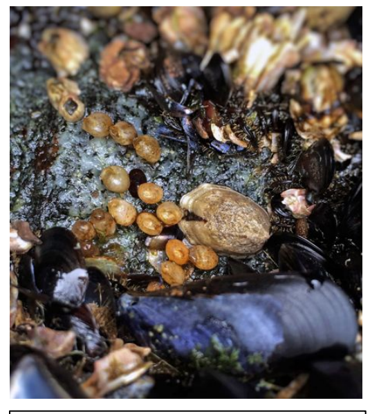
Figure 2. Nucella ostrina egg capsules.

Figure 1. a: A juvenile Mytilus trossulus b: Mytilus trossulus juveniles can often be found in filamentous algae growing near adults pictured above.