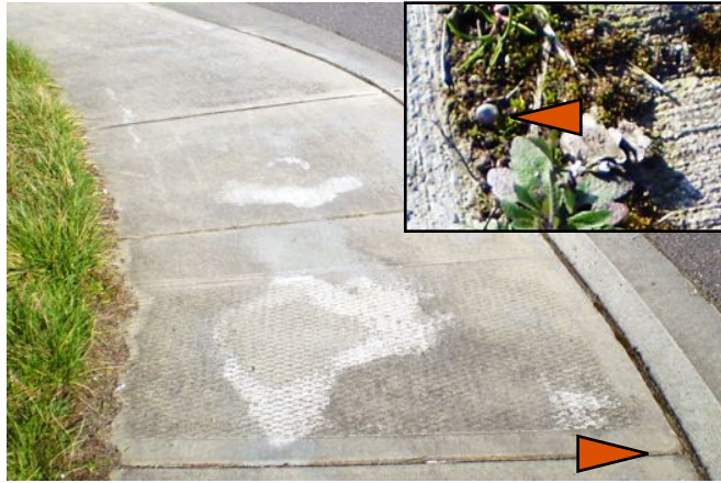
Intersection of Laventure Road and Little Mountain Lane in Mount Vernon. The Oxychilus cellarius [upper arrow] were found living in soil and vegetation between the curb and sidewalk [lower arrow] and would crawl onto the sidewalk when it warmed up.

There were more snails on other leaves and I placed those, along with a small sample of leaf litter, in a bag for further examination. The sample yielded other snail species, including one that demanded return to the park for a further search of the area. That snail was a Discus rotundatus (Müller, 1774), yet another exotic from Europe that has very distinct color markings and sculpture,