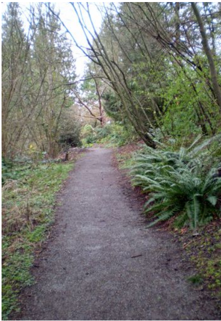
Trail in Queen Elizabeth Park where snails were first observed

The winter of 2009 - 2010 had been the mildest on record for the Pacific Northwest. Trees and flowers throughout the region bloomed a month or more early, and at least one species of land mollusk had emerged from hibernation earlier than normal. It was February, the middle of winter, and not a time I would normally be looking for land snails, but I observed a dozen snails, of a species I could not readily identify, crawling about on a cement sidewalk in Mount Vernon, Washington.