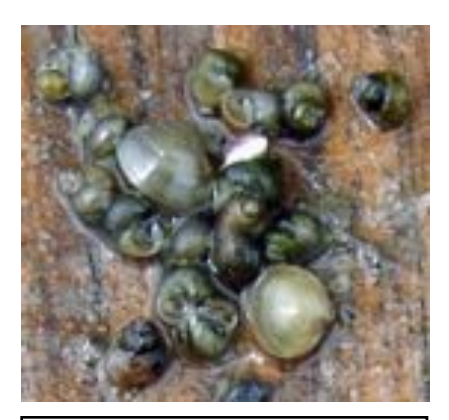
Figure 2. Amnicola n. sp. 1 and sphaeriids from the gut content of a brown trout.

I asked Ernie Buchanan, an avid fisherman who lives in Okanogan County, Washington if he could investigate the gut contents of fish he caught in local lakes for mollusks. I was hoping he would find additional sites for the rare glacial relict snail Amnicola n. sp. 1 found in