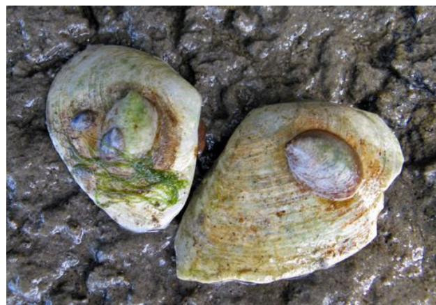
Live specimens found at Goose Point on dead shells

Willapa Bay is not the only location on the west coast where C. convexa has been found. It has also been reported from Boundary Bay, BC, Padilla Bay, WA and San Francisco Bay, CA.