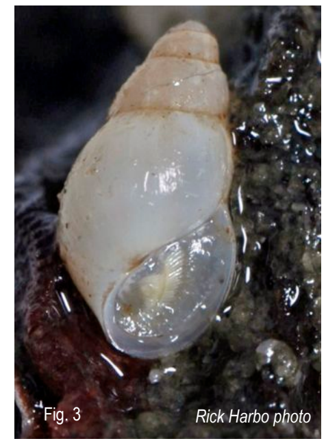
Fig. 2. Fat Gapers, Tresus capax , from Port Moody Arm of Vancouver Harbour, January 30, 2012. Fig. 3. Live Evalea tenuisculpta on the siphon tip of Tresus capax .

Vancouver Island. Scott Walker and Aaron Baldwin have found Odostomia on other clams, Hiatella arctica and Entodesma navicula in Alaska. Divers, Grant Dovey and Mike Atkins recently observed the snails on gaper clams in Clayoquot Sound, on the west coast of Vancouver Island. Bill Merilees has collected Odostomia on rock scallops, Crassadoma and in the mussel matrix of Blue mussels, Mytilus sp.