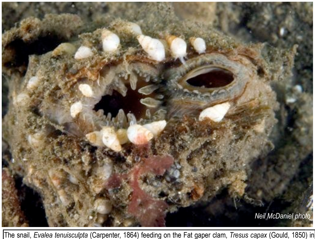
The snail, Evalea tenuisculpta (Carpenter, 1864) feeding on the Fat gaper clam, Tresus capax (Gould, 1850) Vancouver Harbour. British Columbia. Canada. See An Exciting New Discoverv on page 3 .

An Exciting New Discovery: the Lightly-sculptured Odostome snail, Evalea tenuisculpta (Carpenter, 1864) feeding on the siphon tips of the Fat Gaper, Tresus capax (Gould, 1850) in Vancouver Harbour, British Columbia.