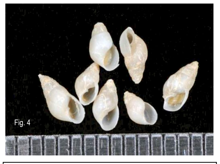
Fig. 4. Shells of Evalea tenuisculpta , 3 to 5 mm shell height, showing the characteristic plicated (folded) columella.

Fig. 2. Fat Gapers, Tresus capax , from Port Moody Arm of Vancouver Harbour, January 30, 2012. Fig. 3. Live Evalea tenuisculpta on the siphon tip of Tresus capax .